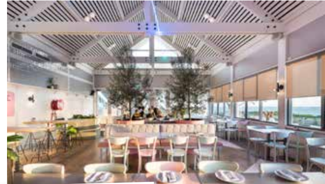
Island Market, Trigg, Perth

This issue, we're absolutely peckish for pastels – from pucky pink dining destinations to cocktail bliss with a side of soft-hued accessories.